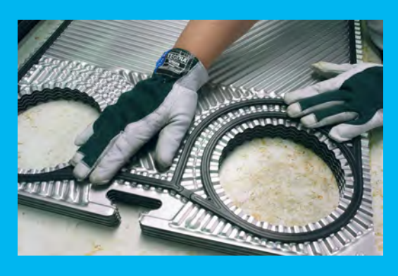
Our cleaning and maintenance services help restore lost heat transfer efficiency.